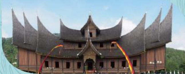
Rumah Gadang, Padang