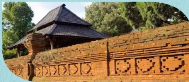
Kasepuhan Palace, Cirebon