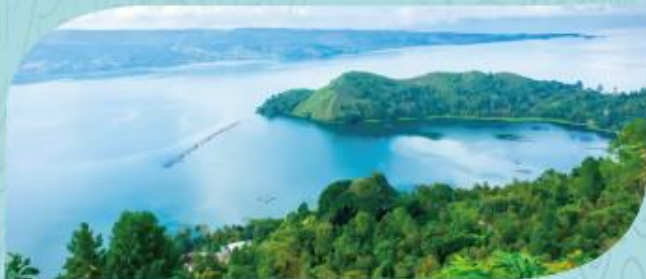
Lake Toba, Medan

For further information please visit : http://darmasiswa.kemdikbud.go.id