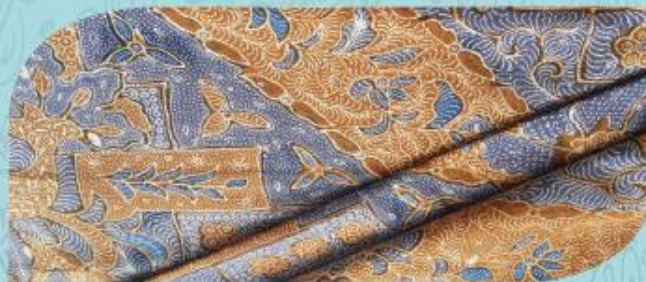
Batik Solo, Surakarta