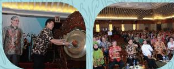
The Opening Ceremony of Darmasiswa RI Academic Year 2016/2017