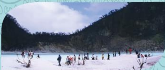
White Crater, Bandung